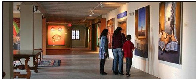
Photo ops in Winslow include of course, "Standin' on the Corner in Winslow Arizona". Off we go to the Navajo Nation Reservation with a stop in Chinle for lunch. Time Changes to MTN time on the reservation and in Utah. Following the lunch and fuel stop, we will divert onto a scenic drive to Canyon De Chelly at Spider Rock and Sliding House Overlooks.